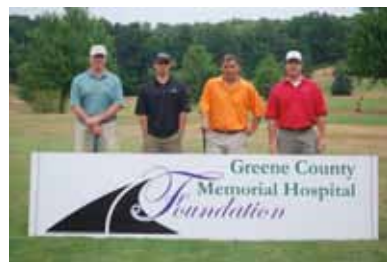
FNB Wealth Management