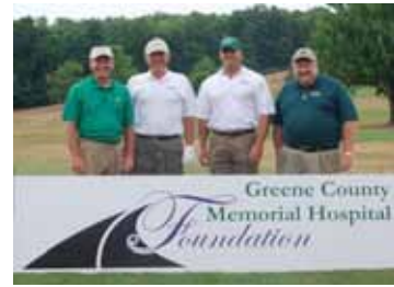
First Federal of Greene County