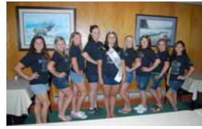
2012 Miss Rain Day Contestants