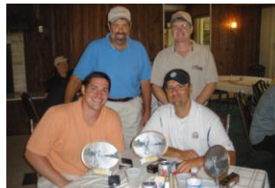
Rhodes and Hammers Printing