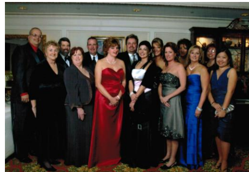
Harvest Ball 2010 Committee